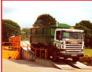
Elevated Enviro Power Wash - No 'dig'