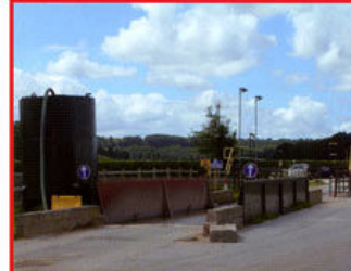
Recessed or buried Drive Thru

Everything is delivered by our own fleet of vehicles fitted with large lorry mounted cranes, operated by skilled and experienced operators.