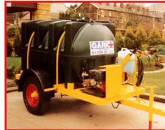
Jet wash Bowser also available