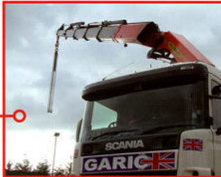
Delivery by skilled operators

Everything is delivered by our own fleet of vehicles fitted with large lorry mounted cranes, operated by skilled and experienced operators.