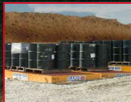
'Barrel Farm' protection using Interceptor Drip Trays