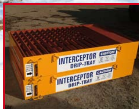
Interceptor Drip Trays

The world's only Interceptor Drip Tray with a patented protection system that safeguards any unbanded equipment such as generators, pumps, compressors, drums and tanks.