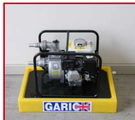
Lightweight Manual Handling Compliant

Interceptor Drip Tray for use under small pump or engine pumps.