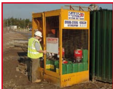
Store 25ltr or 205ltr drums safely and securely

The world's only Interceptor Drip Tray with a patented protection system that safeguards any unbanded equipment such as generators, pumps, compressors, drums and tanks.