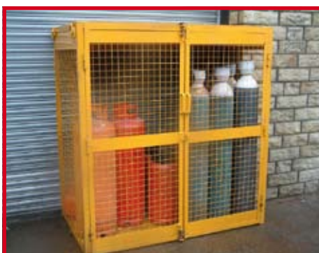
Gas Bottle Store Keeps your site safe and tidy