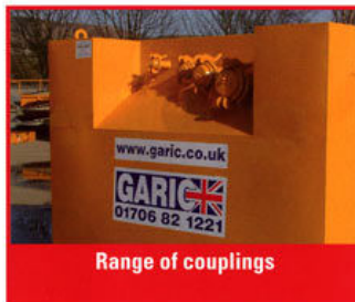
Range of couplings