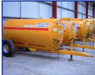
Mobile or Static