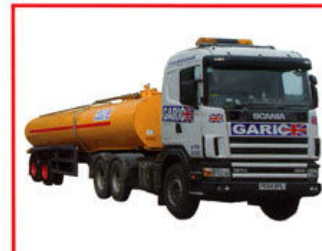
Water delivery/ collection nationwide