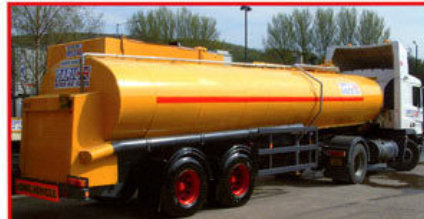
Nationwide delivery of fresh water, for both drinking and site use.