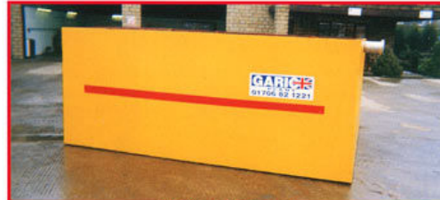
Various sizes and capacities in stock

We will assist you in choosing the correct piece of equipment that will ensure peace of mind when dealing with suspended solids etc.