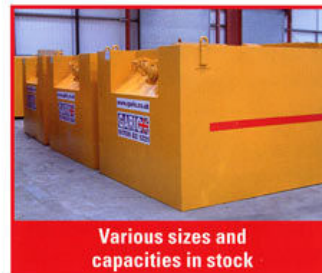
Various sizes and capacities in stock