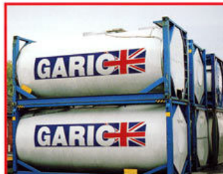
High volume holding tanks

We have large stocks of high volume tanks for the larger projects such as piling, river diversions, overpumping etc.