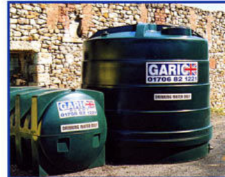
Large or Small

We provide a vast range of tanks, bowsters and tankers for both 'site water' and 'drinking water' all with the option of pumps attached.