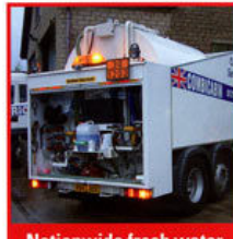
Nationwide fresh water delivery and waste water collection/disposal service.

All sizes available ex stock and delivered nationwide.